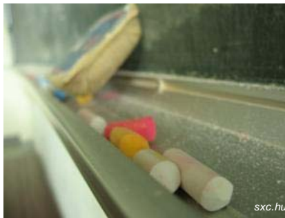
The recordings included fingernails scratching down a blackboard, chalk against slate and squeaking polystyrene.